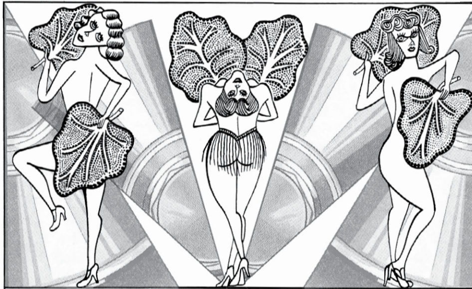
THE RHUBARB LEAF DANCE