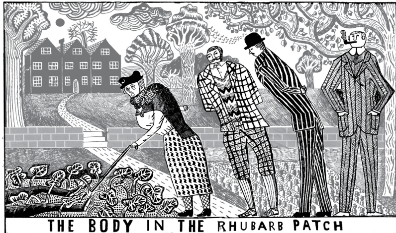
THE BODY IN THE RHUBARB PATCH

two terrines, pickles & Co. 9.5 green beans, bacon & a poached egg salad 9 baked asparagus, salsify & parmesan 9.5 seared venison & artichoke salad 10.5 octopus, monksbeard, potato & fennel 12