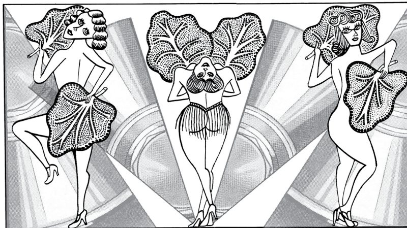
THE RHUBARB LEAF DANCE

roast tomato, green beans, black olive & feta 8.5