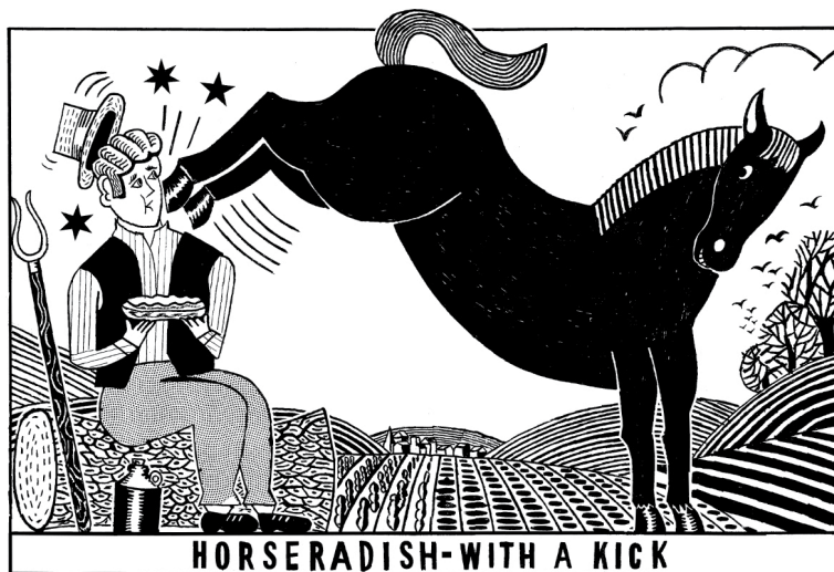
HORSERADISH-WITH A KICK

cod's roe, egg, almond & green sauce 8 crubeens & sauce gribiche 8.5 chickpea, spinach, peas & pistachios 9 grilled bread, feta, tomatoes & mint 9.5 razor clams, pea & fennel salad 12.5