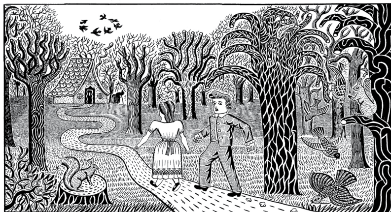
TRAIL OF BREADCRUMBS?