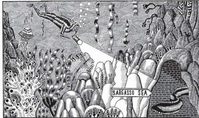
THE CURIOUS CASE OF THE MISSING EEL