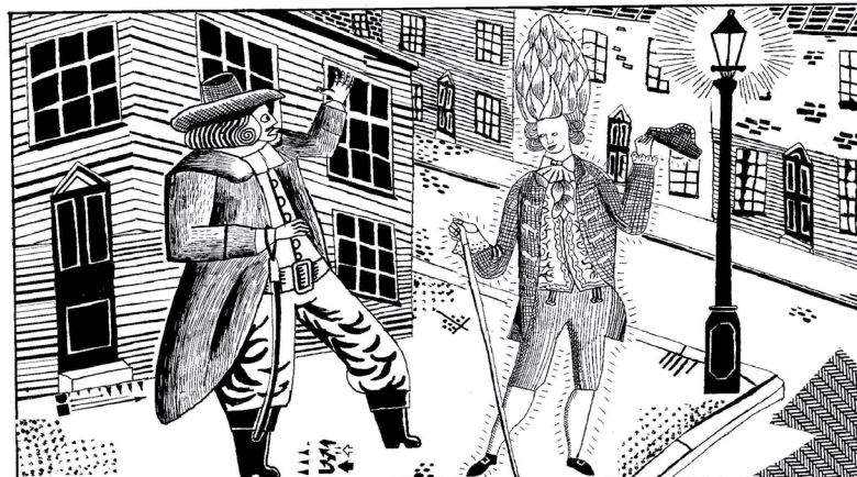
THE SPIRIT OF THE WANDRIN' ASPARAGUS