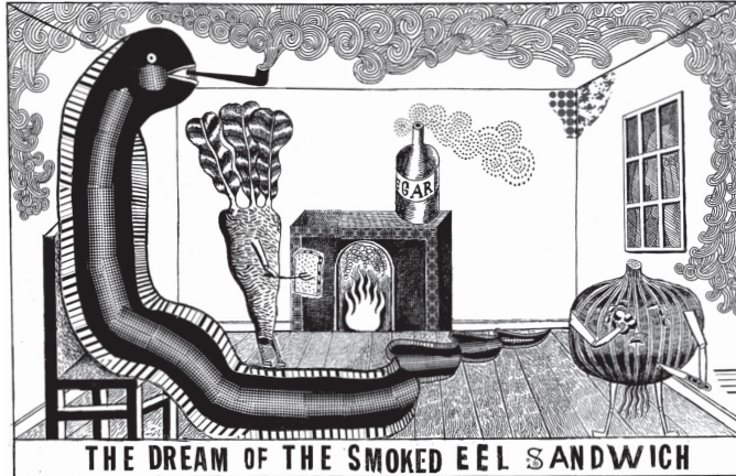
THE DREAM OF THE SMOKED EEL SANDWICH